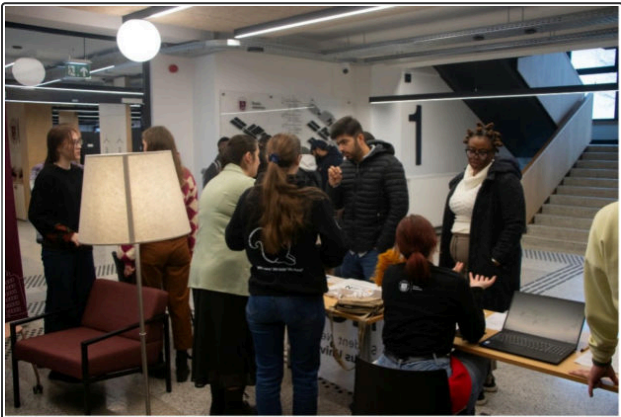
Iniciatyvų diena VU Šiaulių akademijoje

and Šiauliai. On the 11th of February, the SIC team organised an initiative day at the VU Šiauliai Academy and on the 25th of March at the VU Kaunas Faculty. Student initiatives of VU SR were presented to the students studying at these VU units. The participants had the opportunity not only to ask questions to the representatives of the already existing student initiatives but also to learn from the VU SR Student Initiative Centre members how they could establish an initiative in their own community.